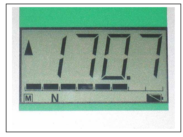
Figure 2 Tension and compression displays

A load indicator bar alerts the operator to how much load has been applied to the load sensor. As the load approaches the maximum rating of the load sensor, the indicator bar changes appearance when above approx. 80% of the rated capacity. This warns you that steps should be taken to prevent excessive load being applied 2.