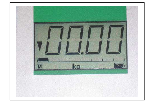
Figure 3b Max Traction