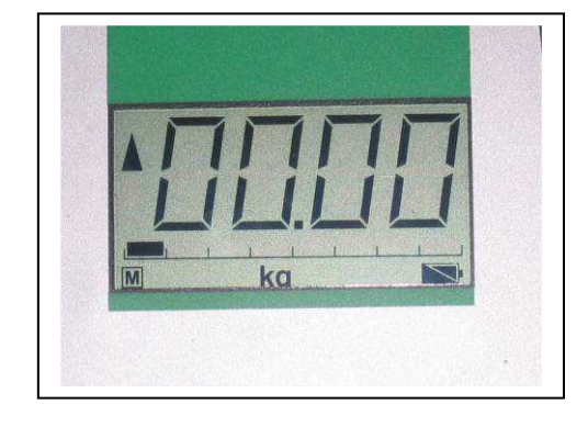
Figure 3a Max Compression

The current load being applied to the load sensor can also be displayed pressing again the key MAX